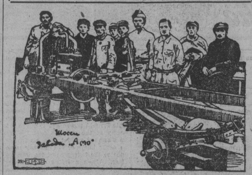
A group of workers at the Russian-American auto factory "Amo," near Moscow. Fifteen members of the Chicago Society for Technical Ald to

reel film was called "The Calvary of Prepares for Alliance with Republicans