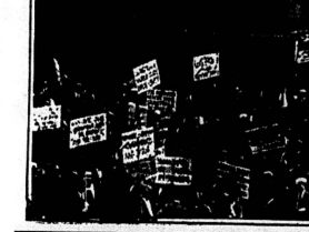
8,000 In Saklatvala Protest!

MEMBERSHIP NOT LIMITED The minimum requirement for this office to become a member of the club or to remain a member, is to secure at least 100 worth of stock, or at least 100 shares of stock, or at least 100 shares of stock, or at least 100 shares of stock.