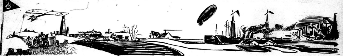
ON 1922 WILLIAM N. HASKELL, director of American Relief in Russia in 1921-22, returning recently from inspection tour of the Union of Soviet Republics declared, "Today there is food for everybody in Russia. In fact, I believe there is more food there than in the United States, and the prices are much lower. The population that was standing in line waiting for bread in 1921 and 1922 is now well fed. The destitution and suffering of those black years is now only a bitter memory."