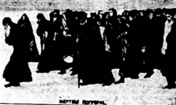
Victims of a Pogrom Driven from Their Homes.

When darkness fell upon the doomed city the terror of the day turned