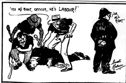
From the London Daily Herald. British "Democracy" Winks at the Crimes of the Fascist.