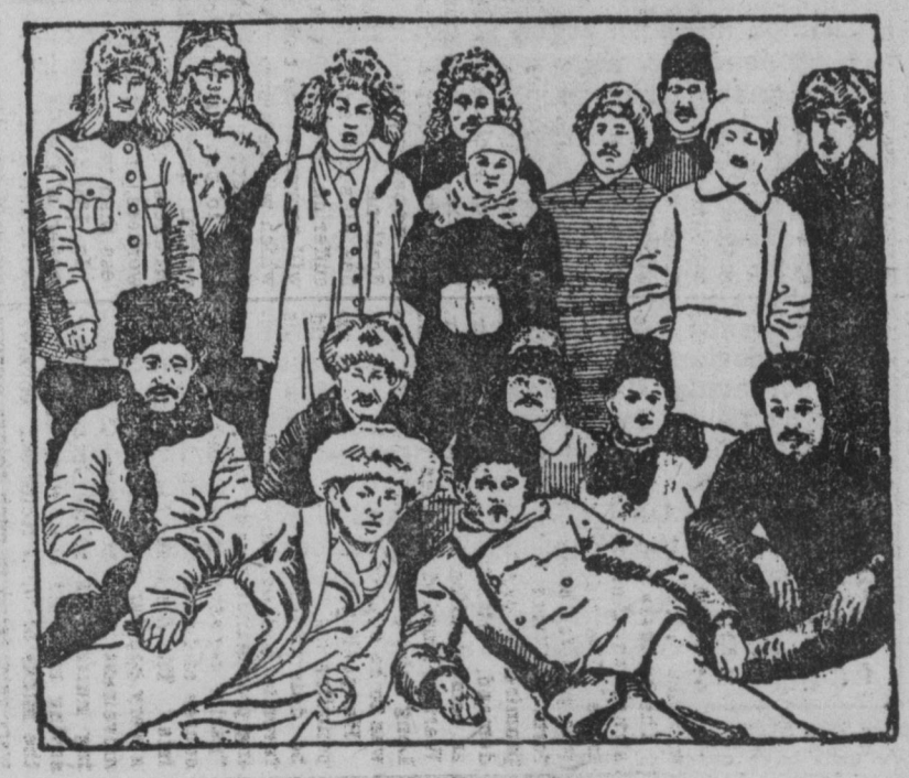
Some Russian Teachers.

education was created, both as regards stans and methods.