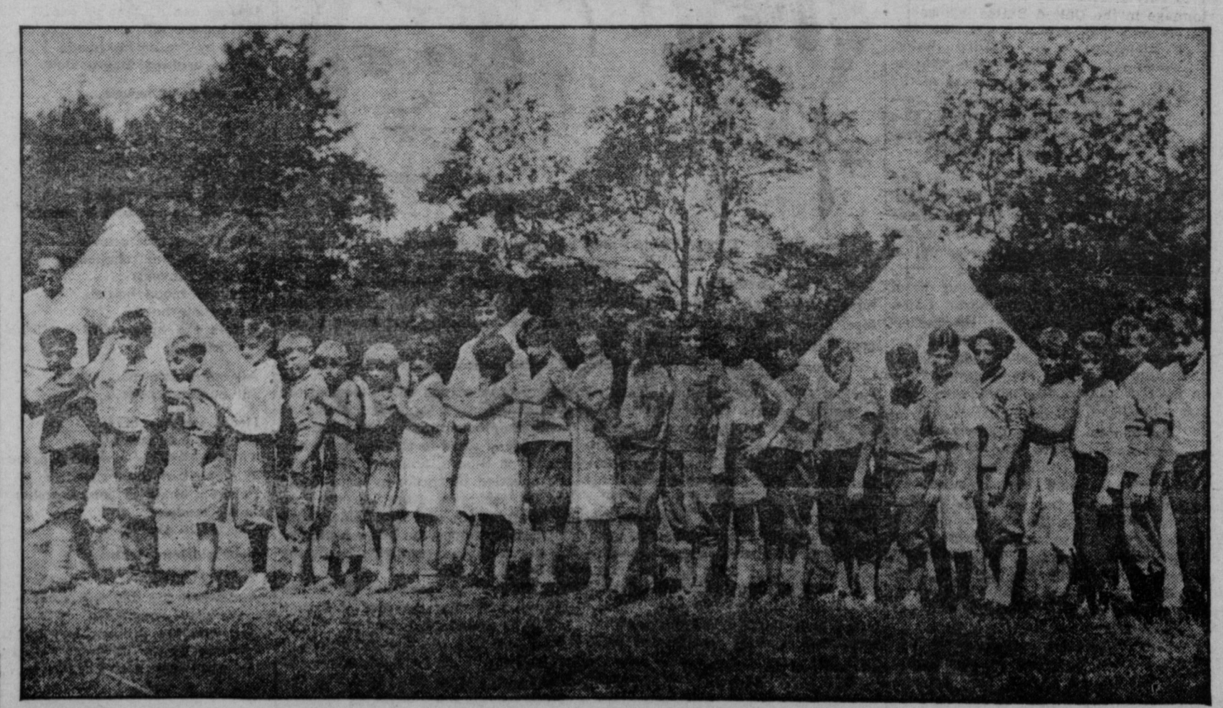
Juniors at the Leninist Camp of the New York League.

At the democratic convention of The campaign of 1900 was obviously 1908 Bryan routed the agents of the (Continued on page 7)