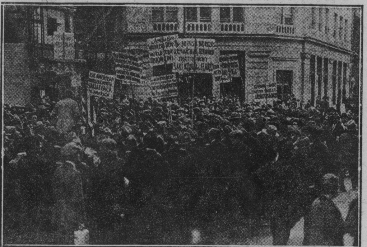
A BOVE are two views of the great throngs, estimated at 8,000 by even the capitalist press, that heard the speakers at the New York City demonstration in historic Union Square against the barring of Shapurji Saklatvala, the Communist member of the British parliament, from the United States. He was coming here to attend the sessions of the interparliamentary union at Washington, D. C. Myriads of placards were carried by those in the demonstration demanding the admission of Saklatvala, urging world trade unity and calling for a workers' and farmers' government in the United States.