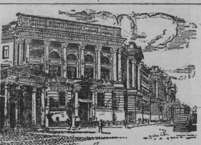
General view of the Academy of Science of the U.S.S.R. at Leningrad.

The ceremony was opened with the "International" played by the band