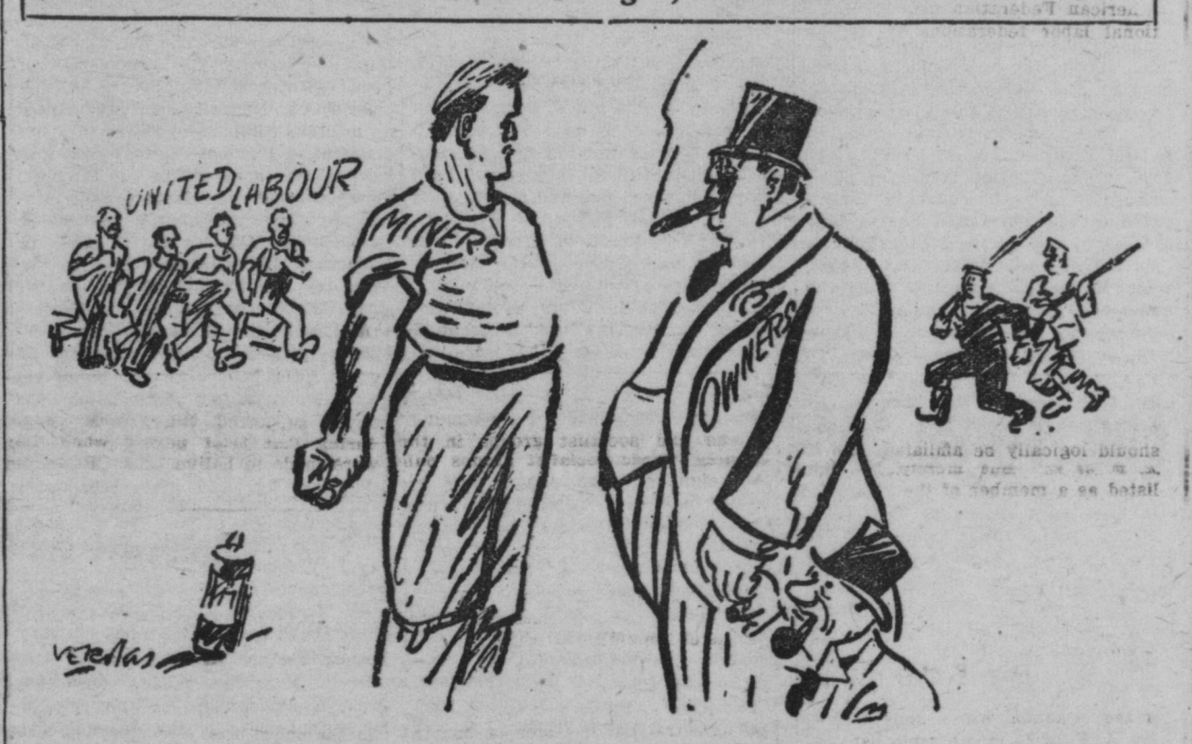
The above cartoon is from the London Sunday Worker and depicts the stubborn fighting spirit which now characterizes the British working class-and is causing sleepless nights for the bosses

ates a great danger for the British | capitalists. It brings into motion huge masses of workers and British capitalism has changed its tactics-it attacks now only the most advanced section of the working class, hoping to cut it off before the reserves ar-