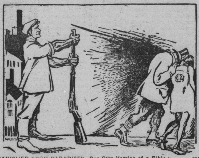
BANISHED FROM PARADISE"-Our Own Version of a Bible S. "Gudok," published in Moscow.)

A few months after this affair the fierce police captain was shot and killed in the center of the city. He had a mounted policemen as a body guard, but the latter ran away as