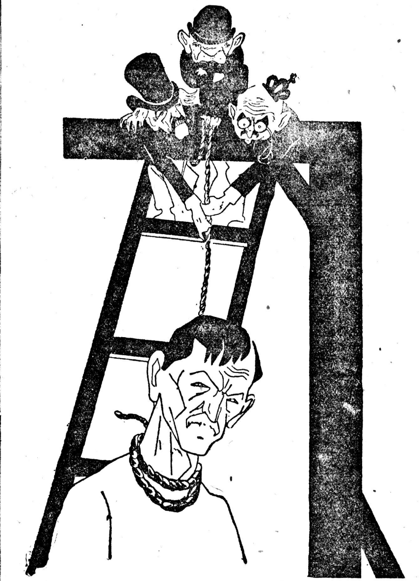
This is how the MacDonalds, the Vanderveldes and their royal friends are putting into practice their expressed desire to help the British miners from falling into defeat.