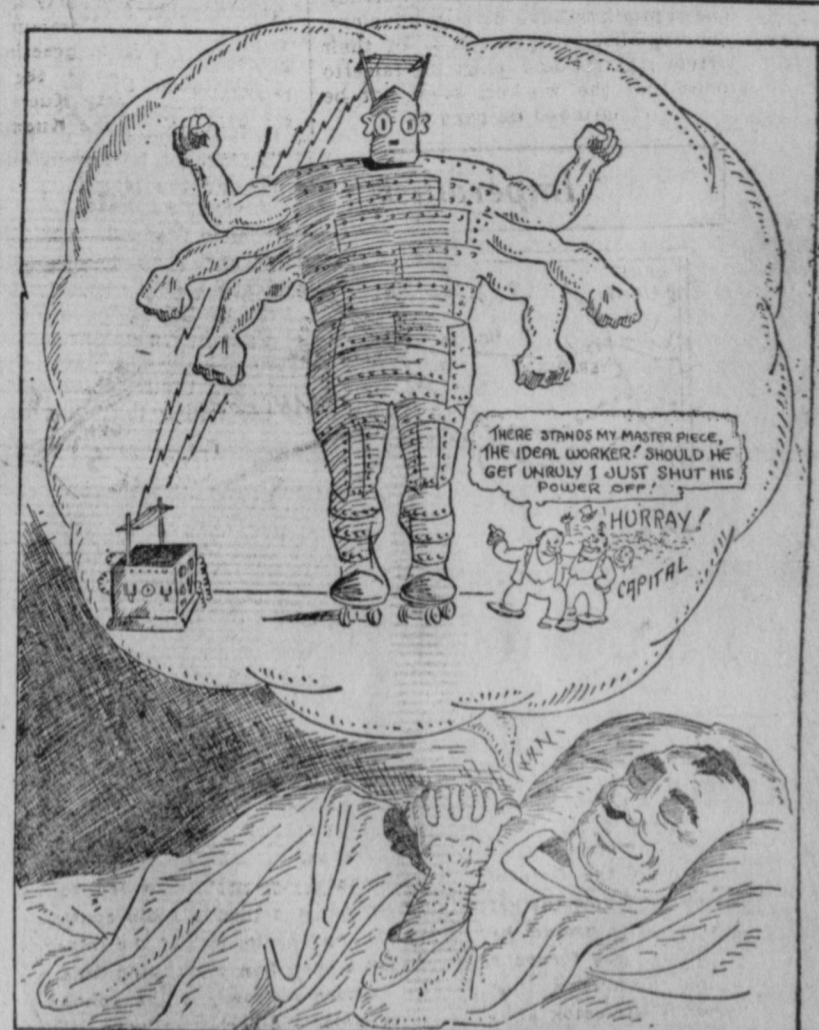
"Oh if they only made 'em that way!"