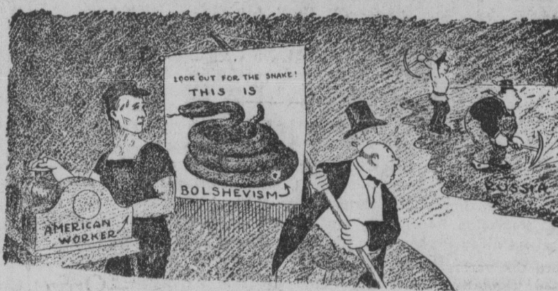
Another Anti-Bolshevik Crusade.