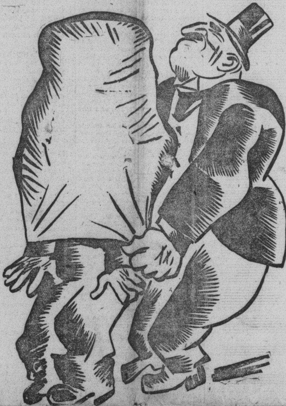
The Miners Are In the Bag of Big Capital.