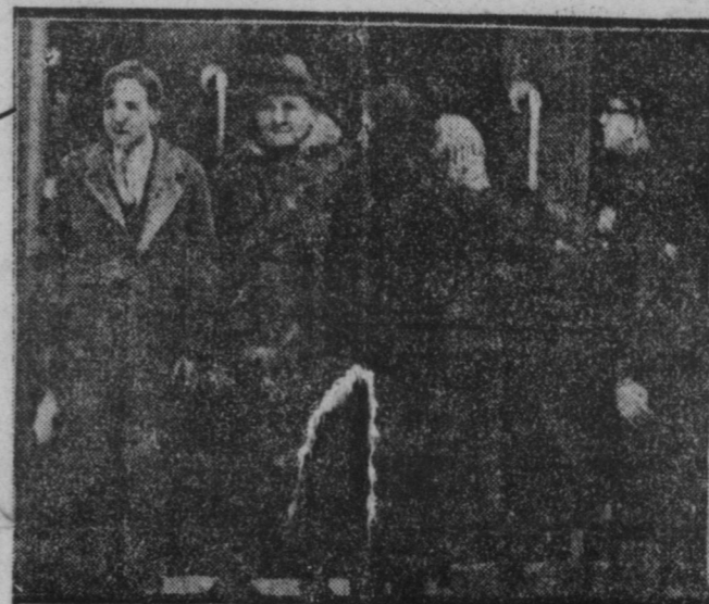
Police Thugs Herding Strikers Into Patrol Wagon.

reorganization of the apparatus of the Comintern in such a manner that all important sections take a greater part in the leading political work of the Comintern. The significance of the capturing of the trade unions and of the struggle for international unity was particularly stressed.