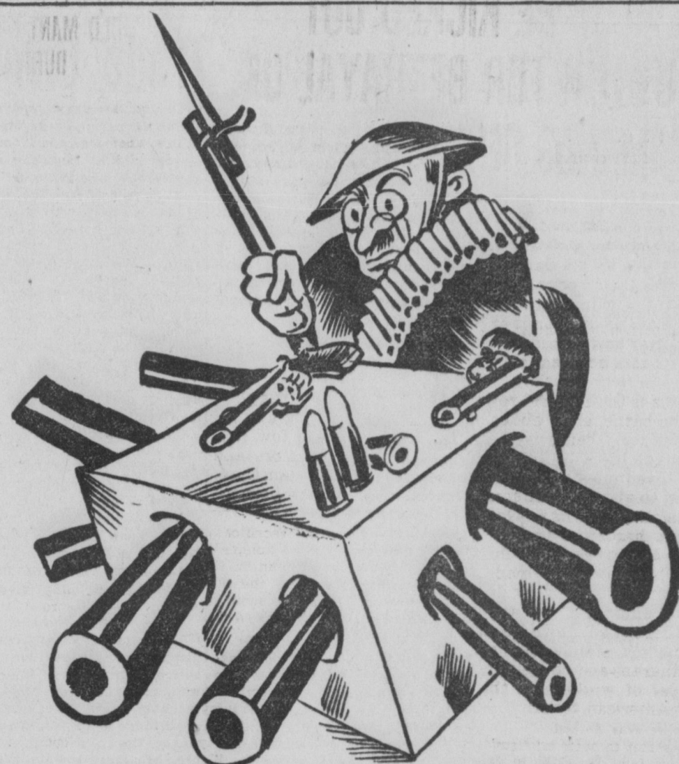
SIGMAN: "Now We Can Proceed to Peaceful Work."