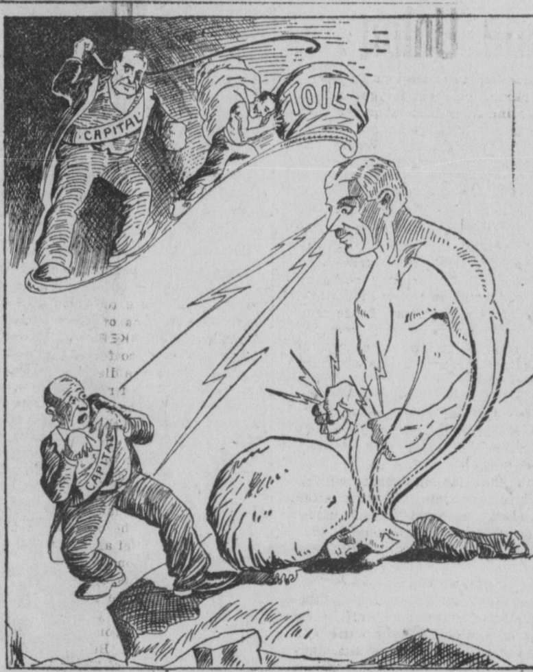
Labor Is Mighty—if It Is Conscious of Its Power.