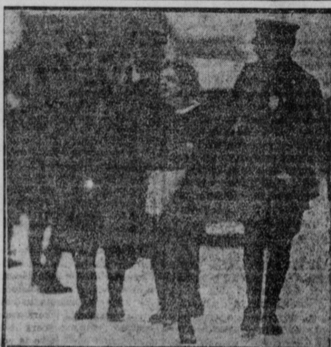
Passaic Girl Striker Seized by Police Bullies.