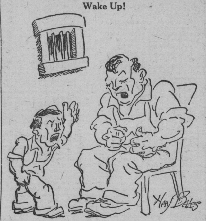
Get the victims of the class struggle out of prison. A working class that willingly permits its fighters to be picked off and imprisoned by the enemy, cannot emancipate itself.

Now every worker must not only do the work, must not do it mechanically, but must put into it all of his intelligence, his feelings, and all his energy. We are builders of the new society.