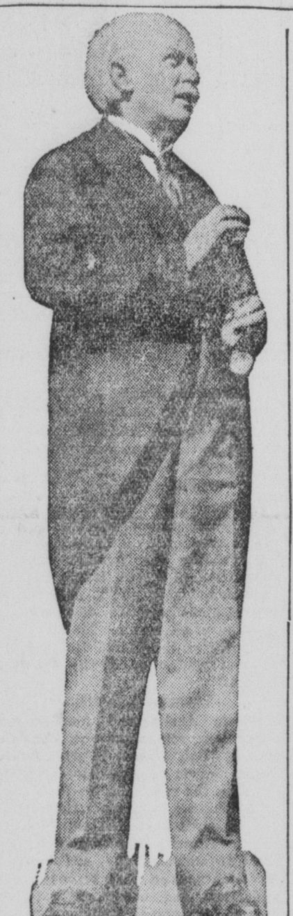
DAVID LLOYD GEORGE. Old fox of British politics, leader of the liberal party all but eliminated in the Tory victory at the last elections. Lloyd George is reported to be active Hold Enthusiastic in attempting to affect a settlement of the present strike. He is losing no chance to make political capital of the struggle. But the crisis seems to be too big for his this time.