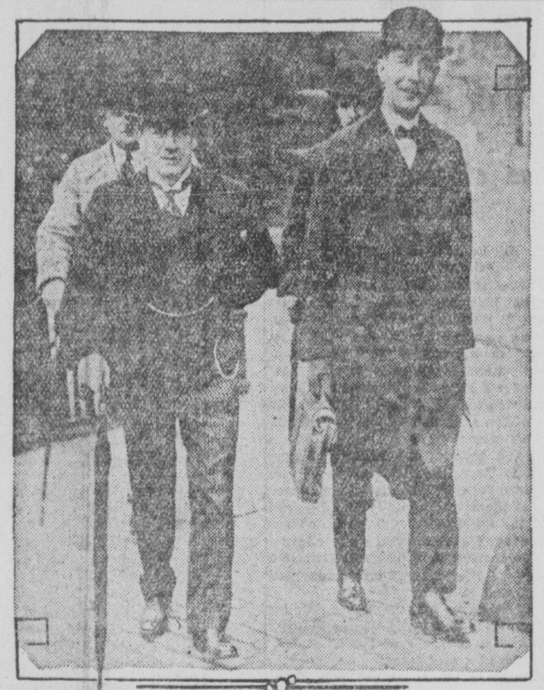
land where 5,000 building laborers went on strike March 1 for $1 an This recent photo shows Prime Minister Stanley Baldwin leaving a hour. Hitherto building laborers have Downing street conference with Col. Fox Lane, minister of mines, just before the crisis broke in England. tion with other building trades, but