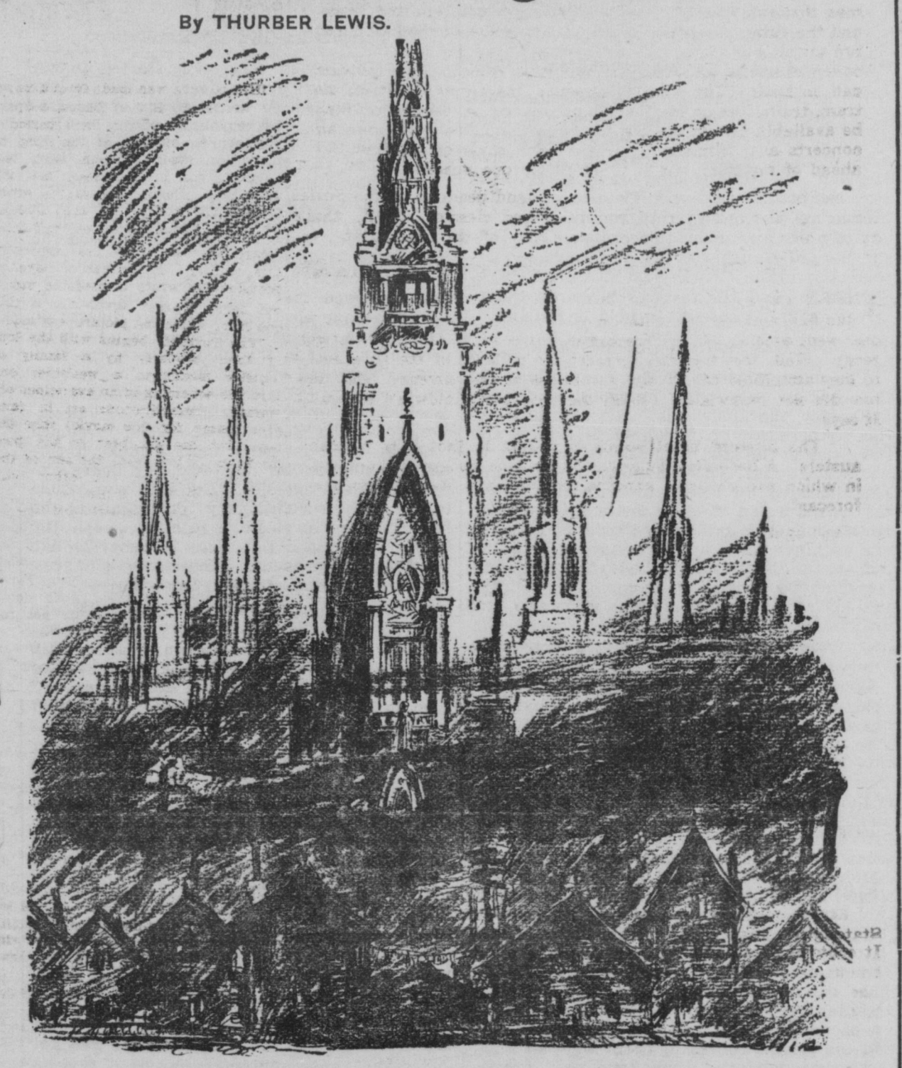
By Fred Ellis

The wine and bread, on this occasion have by the government. been blessed by the pope and are being transported to Chicago under the careful watch of the Swiss guards of the Vatican, Millions of dollars are being spent in the preparations. Great thrones have been erected upon which will sit the papal nunci and visting cardinals. One million pilgrims are expected. Great processions of nuns and monks in the garbs of their different orders will be led by archbishops and primates in purple and red robes. Masses of thousands of voices will be sung, including those of 62,000 children. Services in honor of the Eucharist will be participated in by hundreds of thous-