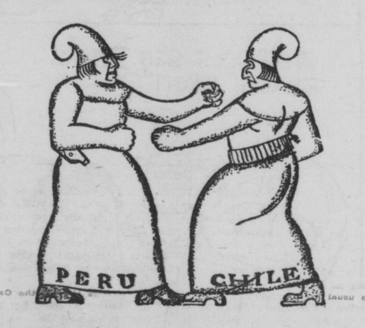
The more the United States exerts itself in favor of harmony between Peru and Chile the more strained become the relations between the two. Isn't it peculiar?

e"Macaco," a deprecatory term meaning a malformed or misbegotten