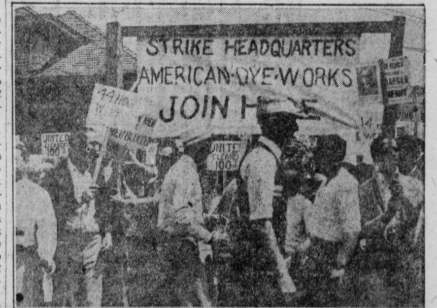
Strike pickets organizing their forces at headquarters for a drive on the plant of the American Dye Works at Los Angeles, Calif.