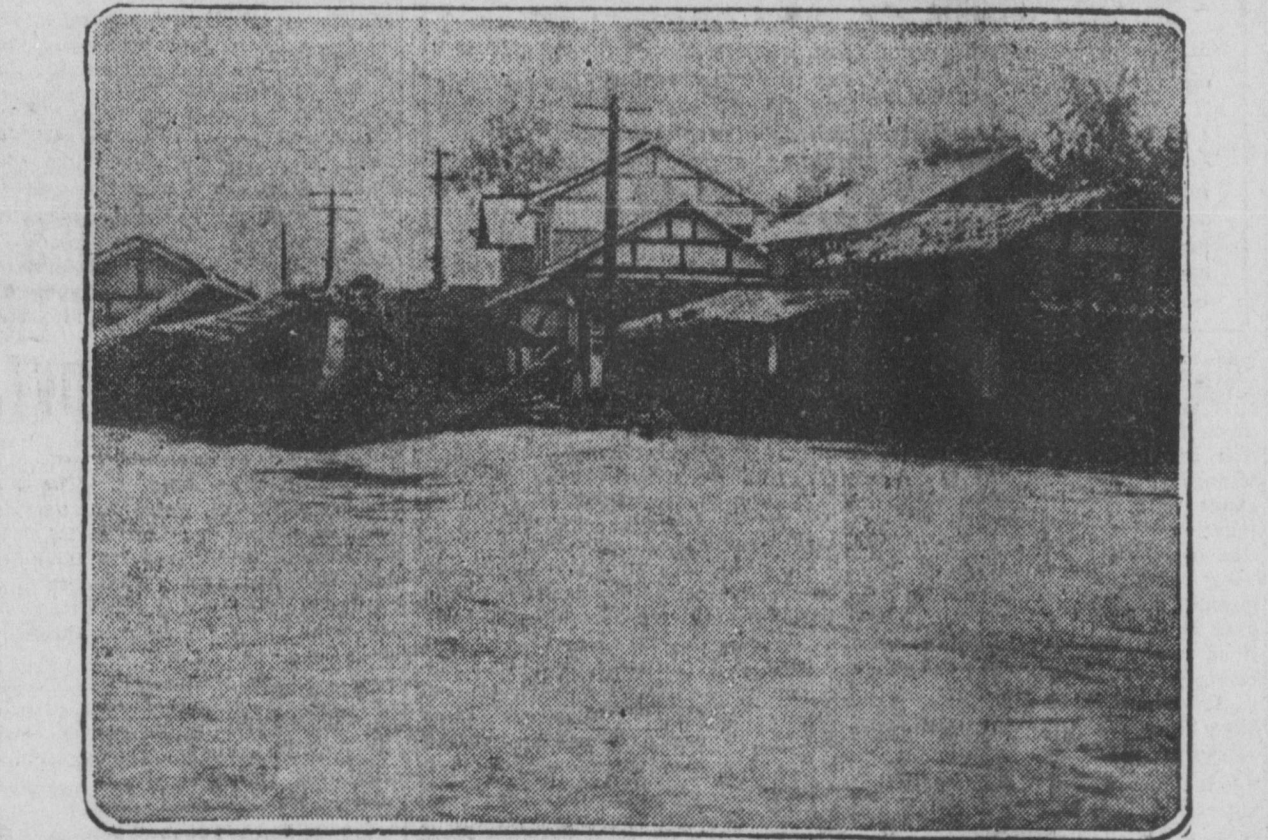
Northern Japan suffers floods which cause the death of scores, injuries to many more and the destruction of millions in property. Photo shows Yamagata in the midst of the flood caused by the unprecedented rising of the river Mogami.