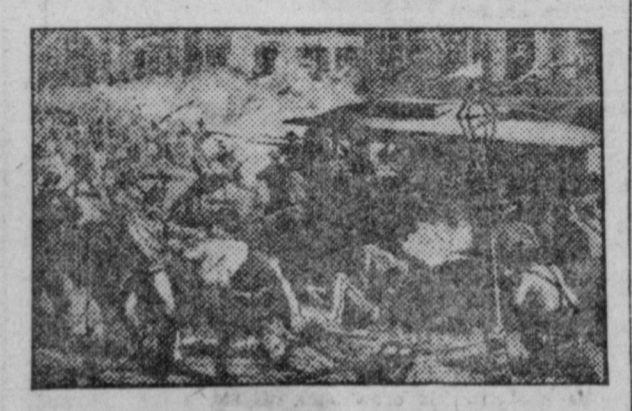
Troops Firing on Labor Demonstration, Baltimore St., Philadelphia.

The huge immigration of this decade, over 5,000,000, aggravated the situation. The labor market was greatly overstocked. Moreover, capitalists had discovered that profits hitherto unheard of could be made from the exploitation of children, and in many lines adult labor was being rapidly superseded by child labor.