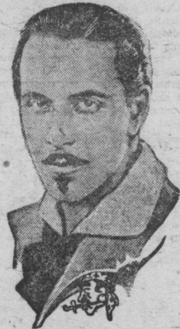
Ricardo Cortez, in, the Eagle of the Sea, now being shown at the Oriental.

Marx united in himself the two characteristics of a gifted thinker. He was incomparable in dissecting a subject into its component parts and was a master in restoring the dissected subject in all its details and diverse forms of development and in discovering their inner relationships. His proof did not allow of abstractions, contrary to the charges of economists incapable of thinking; he did not apply the method of geometricians who, after having taken their definitions from the world surrounding them, entirely disregard reality in drawing their conclusions. One does not find a single definition in "Capital," not a single formula, but a series of analyses of the finest precision, which reveal the most fleeting nuances and the most imperceptible degrees of difference. He begins with a statement of the obvious fact that the wealth of those societies in which the capitalist method of production predominates appears as a monstrous collection of commodities: the commodity, something concrete, no mathematical abstraction, is therefore the element, the unit of capitalist wealth. Marx then holds fast to the commodity, turns and twists it in every direction and inside out, enticing from it one secret after another of which the official economists had not even the least suspicion, but which are nevertheless more numerous and more profound than the mysteries of the catholic church. After he has investigated the commodity from every an-