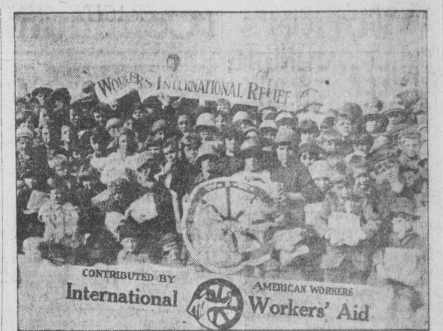
Children of British miners receiving food bought by American workers thru their contributions to the International Workers' Aid. Do not allow those kiddies to go hungry. Send your contribution to the I. W. A., 1653 W. Madison Street, Chicago, Ill.

Kluxers Elected. INDIANAPOLIS, Nov. 5.—U. S. Senators James E. Watson and Arthur R. Robinson, republicans, were apparently safely elected on the face of returns coming in from the last few precincts throught the state.