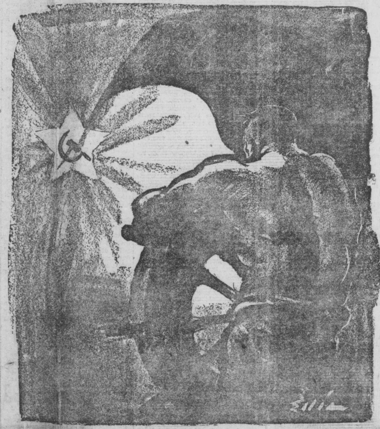
For nine glorious years the star of the Russian Revolution has guided the workers of the world on the road to freedom.