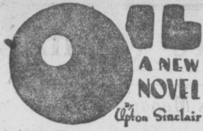
(Copyright, 1926, by Upton Sinclair)

The International Labor Defense, which conducted the defense, immediately announced that the case will be appealed.