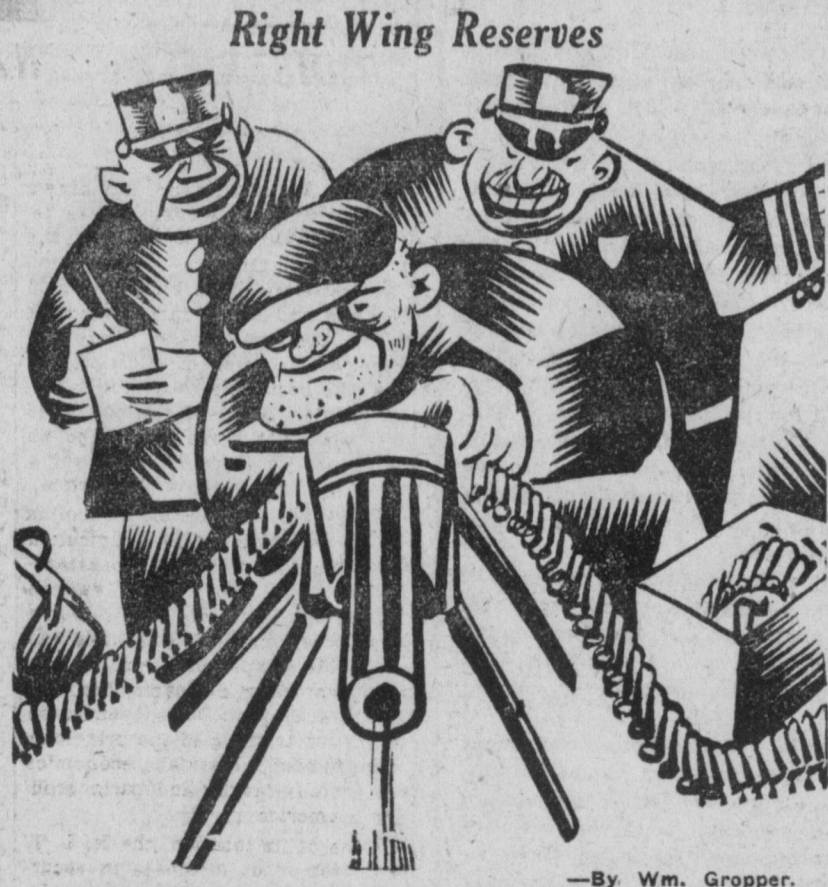
Right Wing Reserves