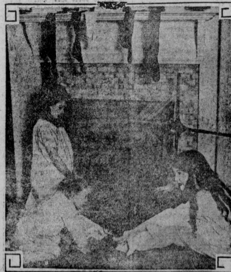
Children of the share's in the profits of labor find the illusion of Christmas a cause for happiness because it means a full stocking.