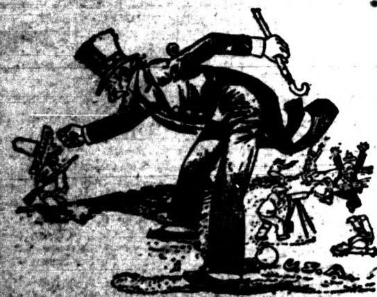
r Our Lives and Property. comes in the Detroit News.

Chinese circles about the meaning of the increasing naval concentration in Chinese waters. The third flotilla from Malta reached here some time ago and was followed by cruisers from the East Indian Squadron. Now we are told the fourth flo-tilla is on its way, allegedly to replace the third. Indignant comment appears in the Chinese press and even in foreign circles there is much wonder