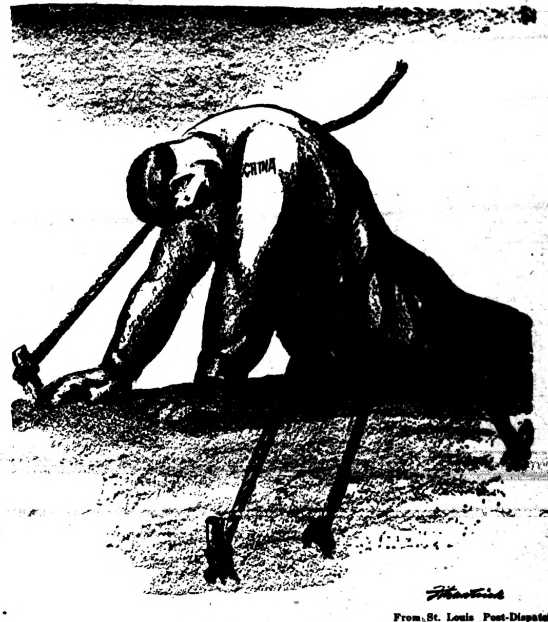
The Giant Is Bursting His Bonds.

It is a mistake, therefore, to assume as socialists do, that the interests of the Chinese worker