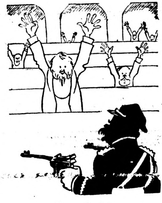
Two-gaa 191 addit.

Now every city boasted such groups. Nationalists, who were ready to die for Dr. Sun Yat-Sen's "Three Peoples Principles"—a slogan which was sweeping throughout China with the rapidity of a forest fire. A government of the people, by the people, and for the people: