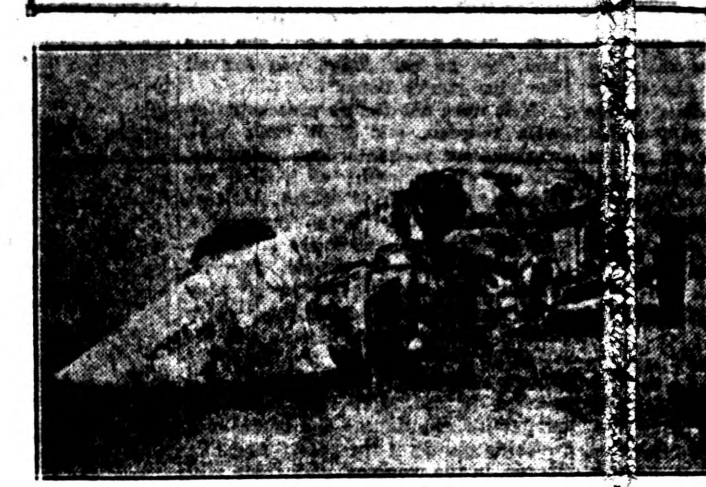
Photo shows the roins of Barry Thomas's racing cose on the Pendine Sands. England, in which the driver met his th when the chain broke while the machine was going 160 miles and tour,