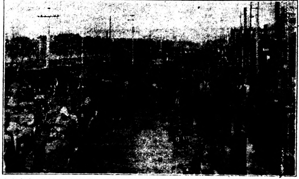
Principal thoroughfare of Nanking, China, scene of imperialist crime. Nanking has approximately 400,000 population