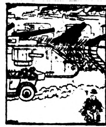
John Bull: "I do not know what effect this will produce on China, but

The entire situation in Shanghai, according to completely neutral observers who have recently passed through that city, is one of psychological fear. The foreign settlement is in the grip of a wholly irrational "funk." The atmosphere of the International Settlement is plainly a war atmosphere, they state. This is now heightened by the presence of British and Indian troops who. necessarily, must be much in evidence about the streets. The parades of these soldiery seem to have been deliberately planned, first to pump confidence into the foreign inhabitants helped greatly to enhance this "war"