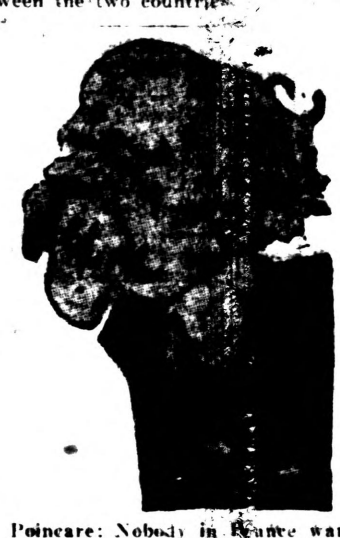
Poincare: Nobedy in Bennee wants to cancel the debt.

The appointment of Kiamil Bey completes the resumption of diplomatic relations between States and Turkey which were brok-(Peasants' Union) from a place about Vagi, and 50 others now facing court en during the world war. Kiamil Bey will be the first Turkist ambassador to Washington since the break be-