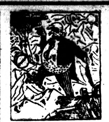
The United States and Mexico: "Hands up! Pacifism for Europe, un-

Nice Words and Bad Deeds. may seek to implant ideas of a "new China and the Chinese, their use of forces, and has exiled several politithe printed word for this purpose is ciars. completely outweighed by these actions in Shanghai. The double pro-