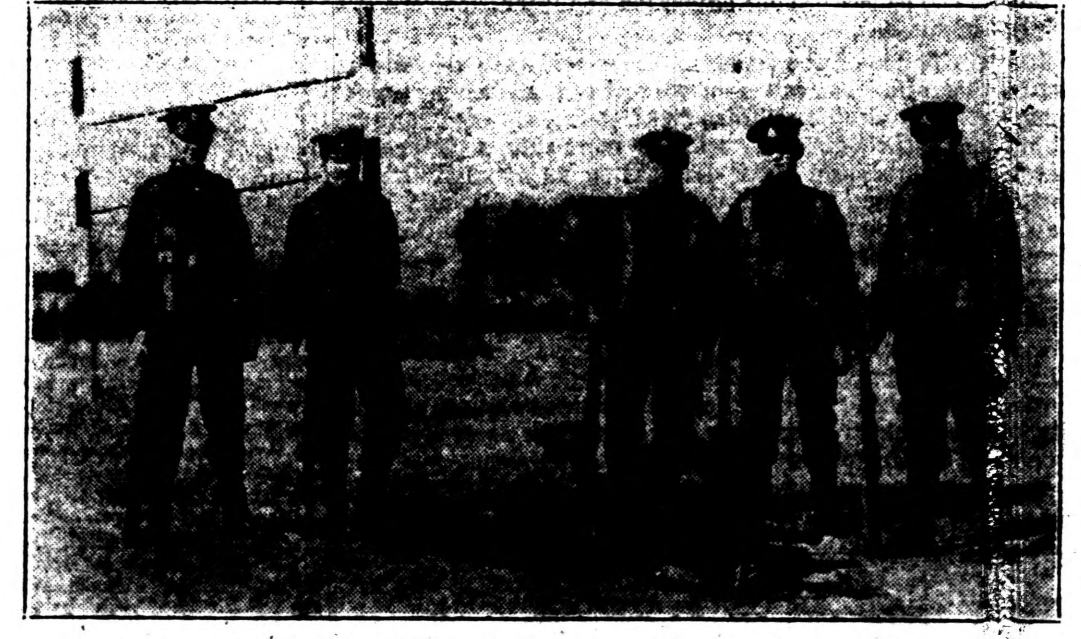
Photo shows British marines' me which they took over and redverted hits a training to