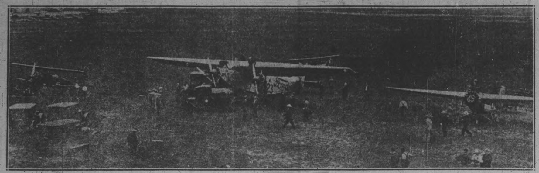
TWELVE AIRPLANES in the Ford reliability tour arrived in New York from Boston, completing approximately 800 miles of their 4,200-mile tour,