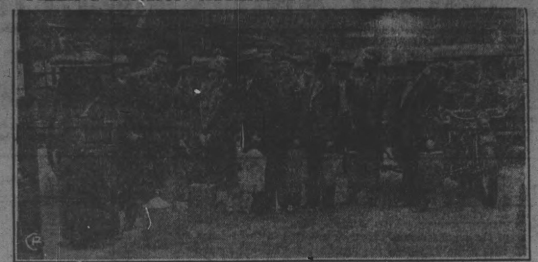
Photo shows "gas" line at one of the few filling stations in Chicago having a supply of fuel on hand after filling station attendant, bad struck.

FILLING STATION ATTENDANTS' STRIKE SUCCESSFUL