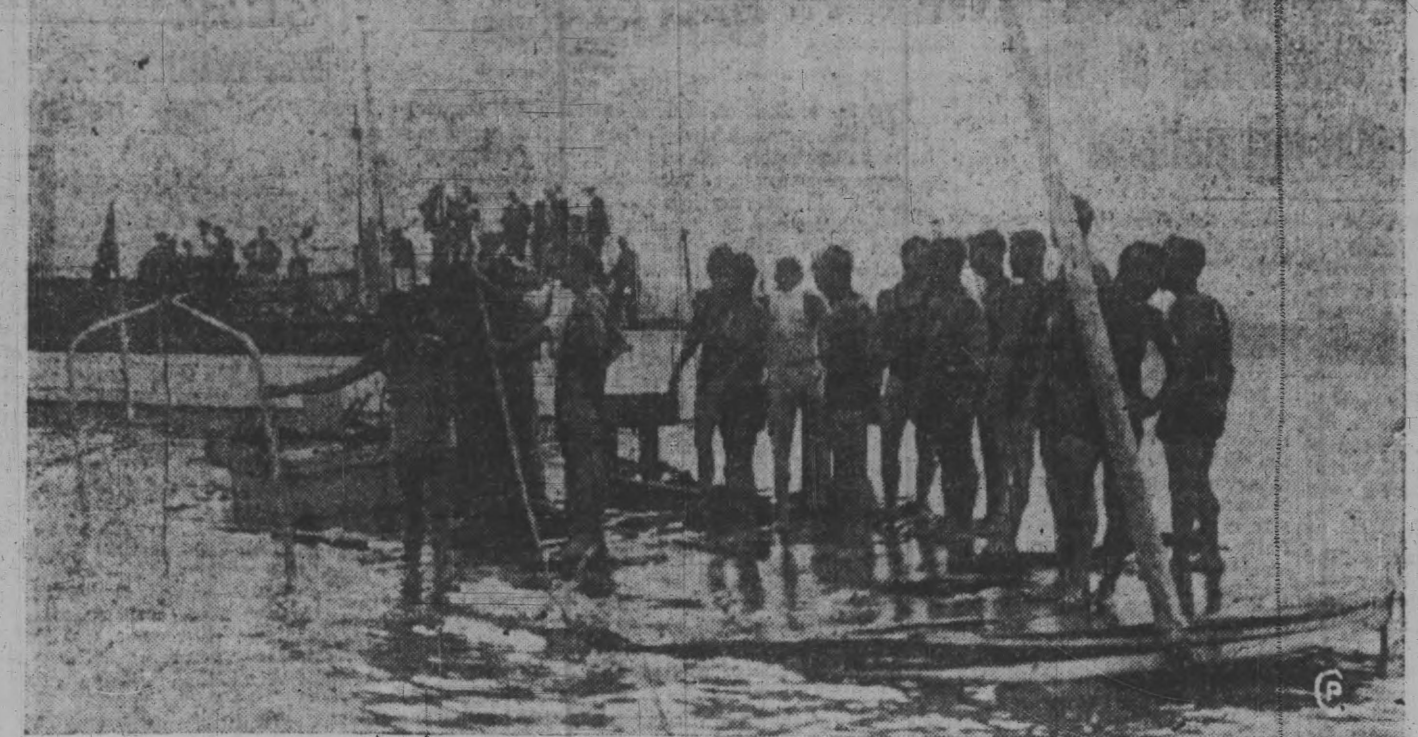
At least thirty-eight men, women and children were drowned when a loaded excursion boat, the "Favorite" turned over in Lake Michigan, a mile off shore. Most of the victims were workers or members of worker families, seeking a little coolness after torrid days in the mills and factories of Chicago. Investigation shows the boat overloaded, the life prese ves too rotten to float, and many of them tied so tight they could not be

RECOVERING BODIES FROM EXCURSION BOAT SUNK OFF CHICAGO