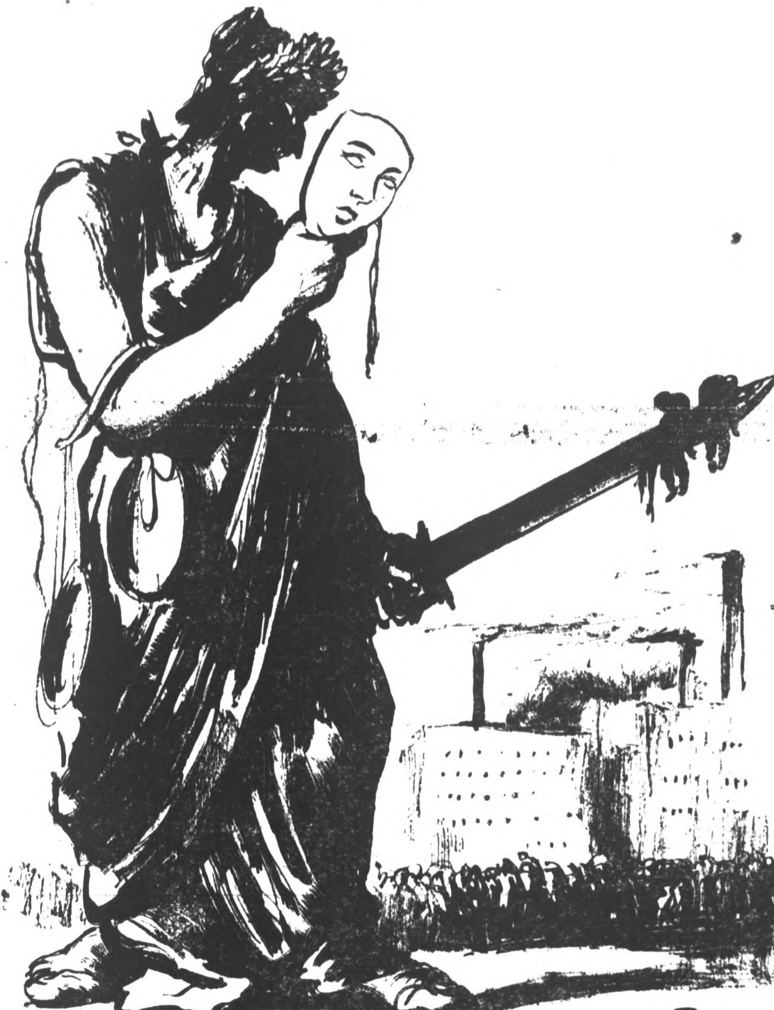
Justice For Labor In Massachusetts

They were tossed into huge wastebaskets, and then taken away and burned by the janitor. They were on the floor, they were in the corners, they were cynically walked upon by the class-conscious Governor of Massachusetts—the electric-chair Governor.