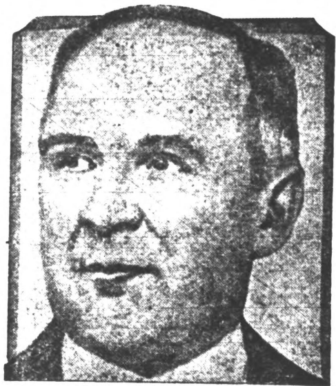
Governor Alvin T. Fuller. Executioner of the two innocent workers. This manufacturer of Packard cars, his fortune valued at $13,000,000, hopes now to step to a chair in the White House over the shattered bodies of Sacco and Vanzetti.