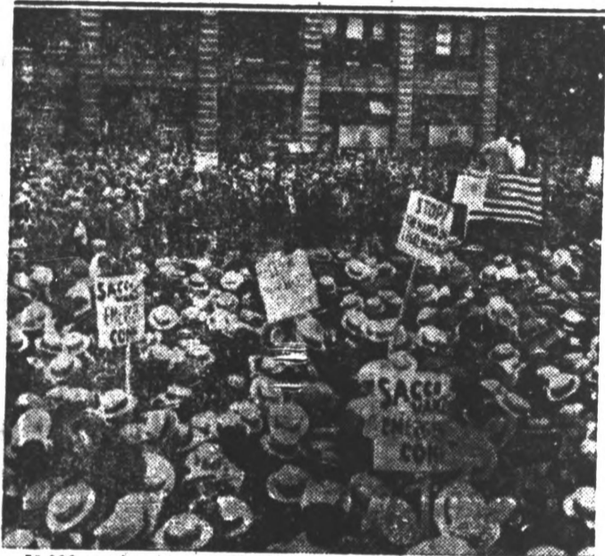
50,000 workers crowd Union Square to demand freedom for Sacco and Vanzetti—in the face of machine guns, armored motorcycles, gas and tear bombs, and 2,000 cops.