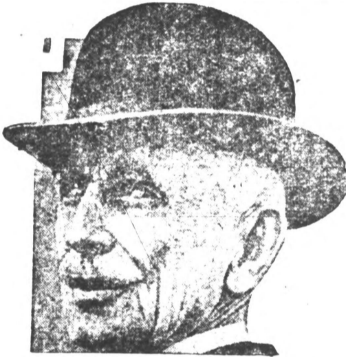
Webster Thayer, who presided at the "trial" of the frame-up victims. His conduct at that time was violently prejudicial to the defendants, and even Fuller's reactionary committee described it as "indiscreet." When he sentenced Sacco and Vanzetti in Dedham last spring he didn't dare look in their faces once during the entire proceedings.