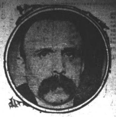
BARTOLOMEO VANZETTI (1888-1927)

Born in Valla Falletto, Italy. Unmarried. Came to U. S. in 1908. Worked as restaurant dishwasher and pastry cook in New York; in cordage mills at Plymouth, Mass. Blacklisted after strike there and began to peddle fish in Plymouth. Was active as speaker, and writer.