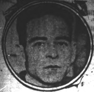
NICOLA SACCO (1894-1927)