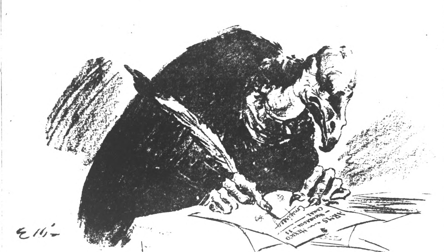
American imperialist interests that crushed the liberal regime in Nicaragua and wish to control all Central America have opened a new fight on Mexico thru the use of forged documents, Mexico being the most formidable obstacle to Wall Street's aims in Latin America.