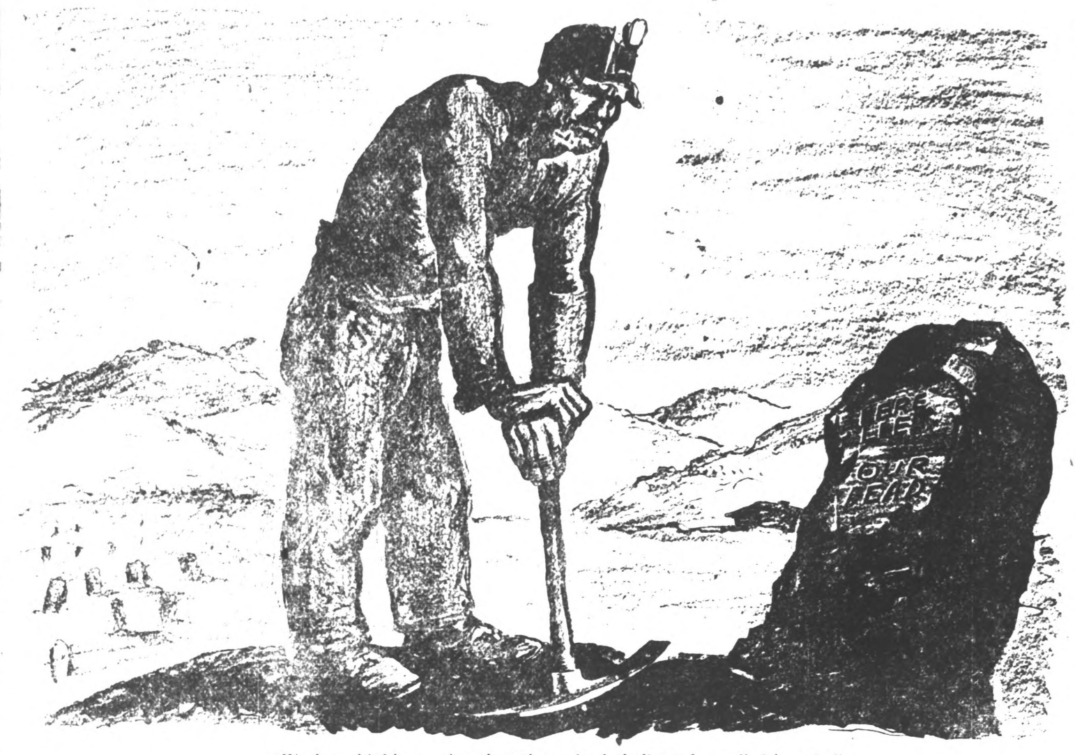
"We here highly resolve that these dead shall not have died in vain."

IN THE COAL MINERS' FIGHT AGAINST SLAVERY