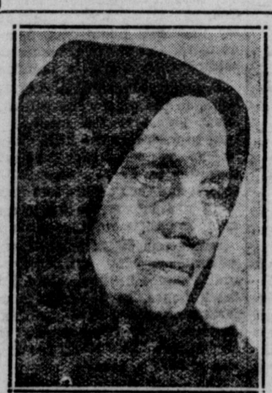
the picture "The Passaic Strike."

THE BLACK FIRM E-BLACK THE TEMPTRESS—Greta Garbo plays hell with a few men (Tivoli). VARIETY—See this one. LONDON—Miss this one. BREAKING CHAINS—Miss meals this one.