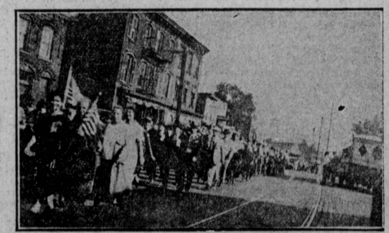
STRIKERS MARCHING-ORDERLY BUT DETERMINED