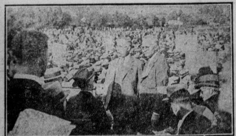
GREAT MASS MEETING OF STRIKERS