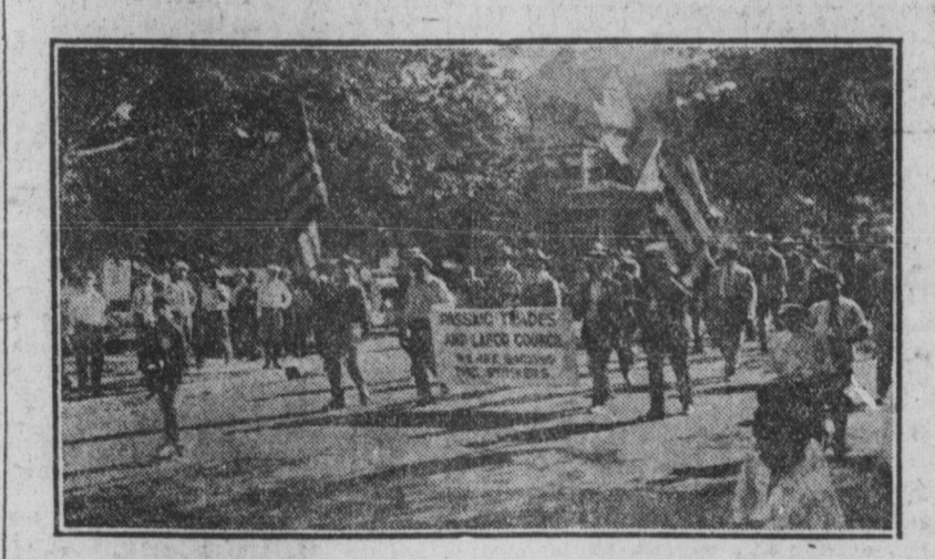
LOCAL A. F. of L. SUPPORTS PASSAIC STRIKE

workers listen to their 1000th speech Again Active": twelve months?