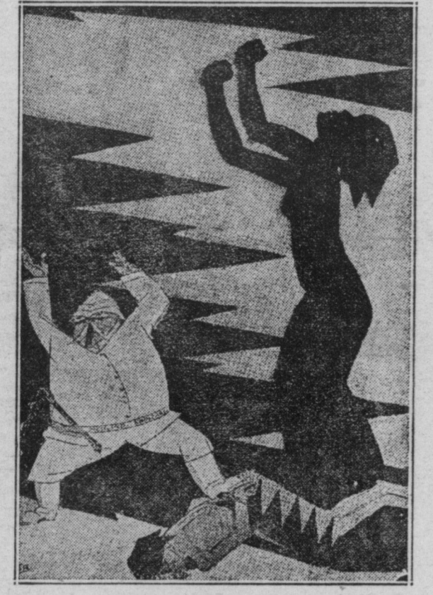
DUTCH INDIES RISES. Dutch Indian Capitalist: "Police! Soldiers! Help! Help!"

The young novelist accepted, as a socialist, the opportunity which this situation provided for agitation. But the packers, and large business interests in general, were aroused, and all their power and influence was used to keep this agitation from reaching the public, and to represent the young agitator as an irresponsible sensation-monger. He set up a publicity bureau, worked twenty hours a day, wrote articles, sent telegrams, and gave interviews to roomfuls of reporters; but so thoroughly had the newspapers been mobilized by the business interests as a medium of defense that the publicity he actually achieved for the workers' cause