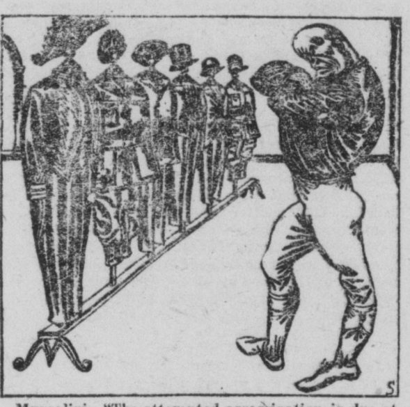
Mussolini—"The attempted assassination is due at 12:50 prompt. What shall I wear for it?" —Simplicissimus, Munich

But Vandervelde, the seasoned capitalist cabinet minister and real leader of the party, is not easily to be frightened by such warnings. Capitalism still requires his support to carry through the stabilization of the Belgian franc and the rationalization of Belgian industry at the expense of the Belgian working class. He boasted of the achievements of himself and his party in helping capitalism to survive the storm which it had raised among the masses through its policy of plunging the world into war. He boasted of the stabilization of the Belgian franc. He boasted that the participation of himself and his party had aided in the stabilization of capitalism, which in simpler English means that he had made capitalism more secure. He declared that he was not only afraid of a government more to the right of the present one, but also of a gov-ernment more to the left! Either of these would endanger stabilization. He was supported by the