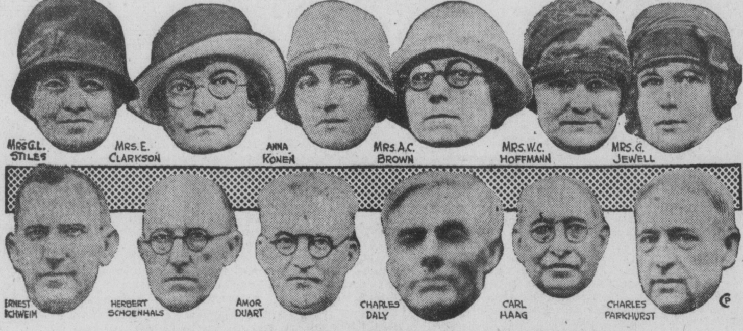
Closeups of the six men and six women jurors in the Sapiro-Ford libel trial at Detroit.

THESE JURORS TO DECIDE WHETHER FORD WILL PAY MILLION