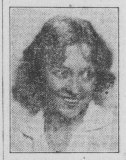
In "Broadway," the Jed Harris hit now in its ninth month at the Broadhurst theatre.