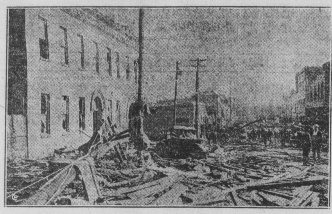
View of business section of Poplar Bluffs, Mo., virtually wrecked by a tornado that took more than