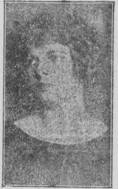
In "Ned McCobb's Daughter," the Sidney Howard drama at the Golden Theatre.