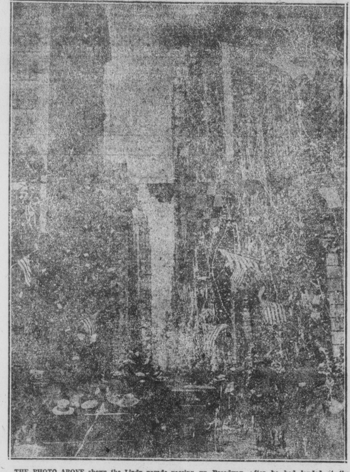
THE PHOTO ABOVE shows the Lindy parade passing up Broadway, after he had landed at the Battery, on his way to City Hall. The picture was snapped in the heart of the financial district. Look at the decorations and the confetti and torn up paper floating in the air, resembling an artistic snowstorm.