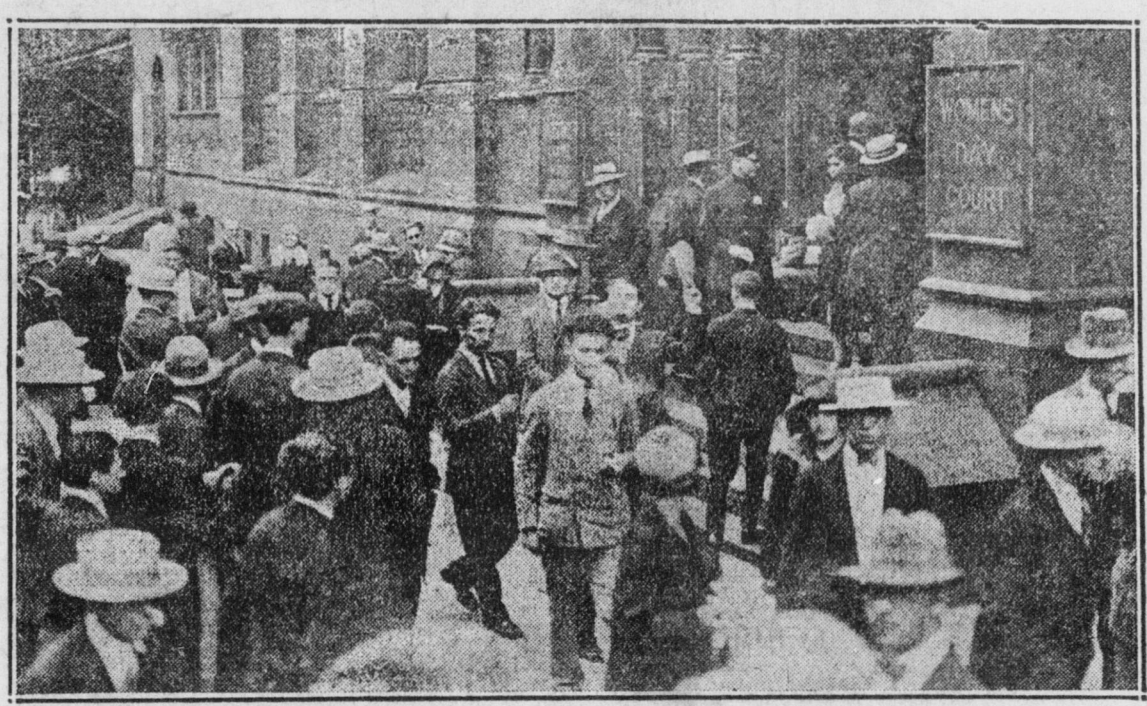
Striking furriers leaving Jefferson Market Court just after Magistrate Ewald imposed sentences of jail and fine on women pickets. The judge was hissed, and the police attacked the crowd in court.