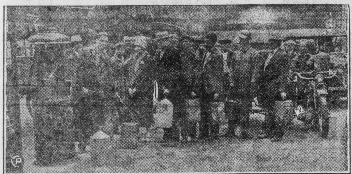
Photo shows "gas" line at one of the few filling stations in Chicago having a supply of fuel on hand after filling station attendants had struck.