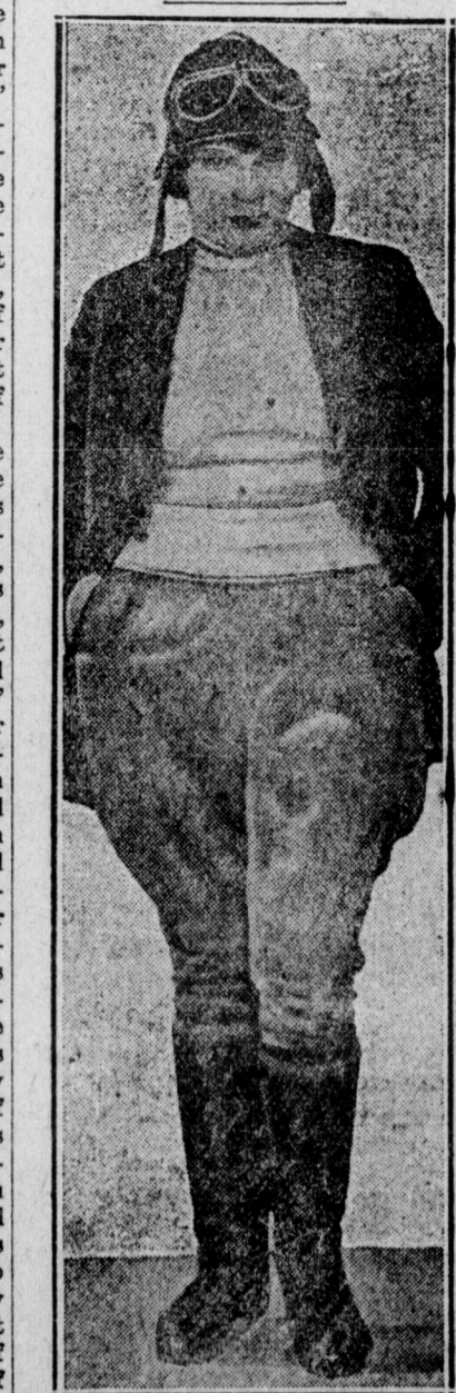
stop flight from Ne

Company, and not for the workers. An immediate task for the progressive elements in the I. A. of M. is to conduct a nationwide campaign against the Baltimore and Ohio Plan. linking it up with Willard's advocacy of the ten-hour day.