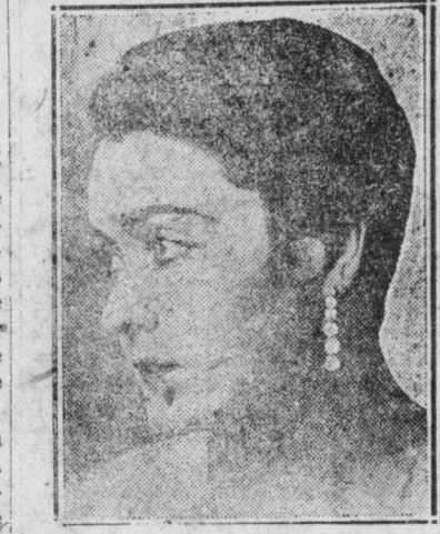
In the Shubert revue "A Night in

On the same program will be an extremely significant film called seas. It was the custom of all sub-