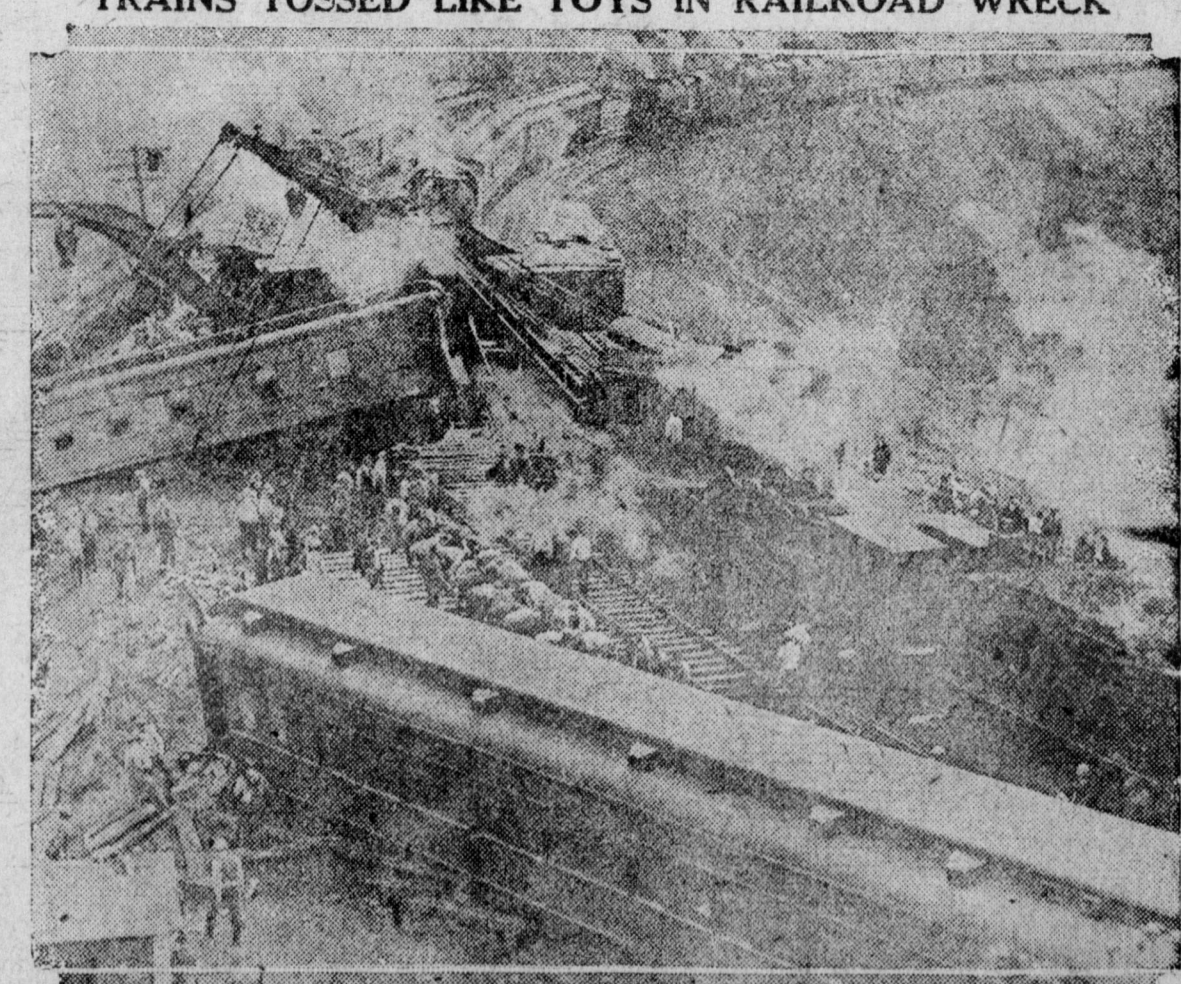
Two persons are dead and several are suffering injuries as the result of the wreck of the roadway Limited twelve miles from Altoona, Pa. Cranes are shown removing the debris.