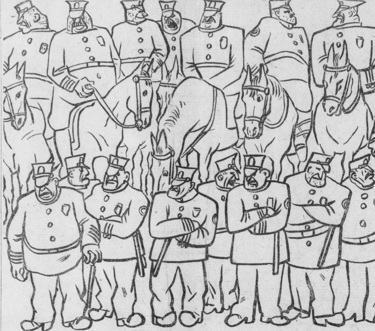
Uniformed police and "dicks" in plainclothes infested every protest demonstration held for Sacco and Vanzetti thruout the country. On most occasions they were fortified by machine guns, armored motorcycles, gas and tear bombs, and clubs.