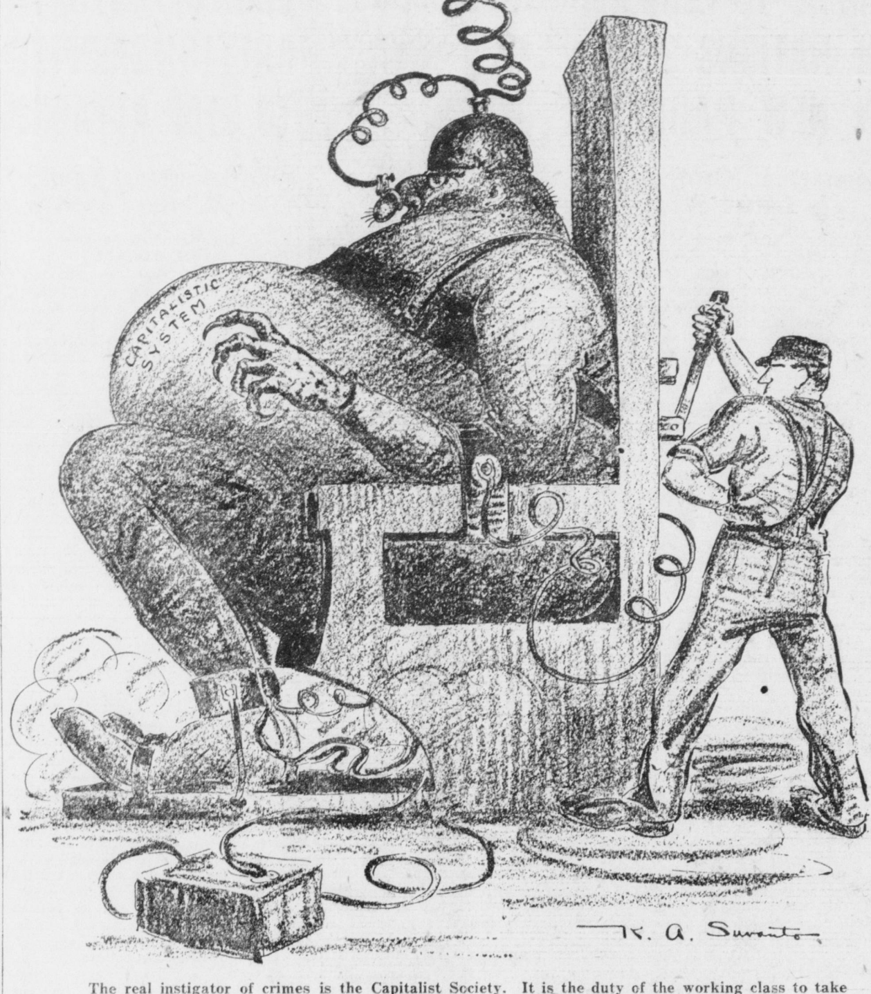
The real instigator of crimes is the Capitalist Society. It is the duty of the working class to take

spirits remain more truculent than not yet deterred us from the fight.