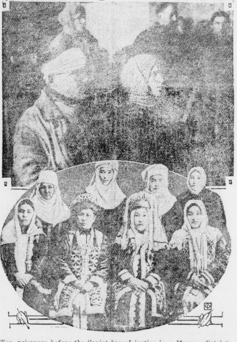
Top, prisoners before the Soviet bar of justice in a Moscow district; below, jurywomen of women's court in Aktyubisnk Province.

further intervention in China impossible; to prevent the manufacture of munitions, the transport of troops, those just prior to the world war, social-democrats, he declared, do not for freedom.