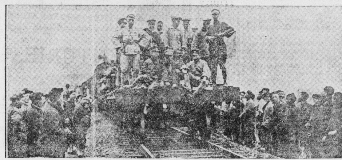
Reactionary troops who have retaken sections of Canton from the workers and peasants have murdered militant workers without the semblance of a trial. The above photo shows vanguard of army of General Chang Fak-wei, one of the reactionary leaders.