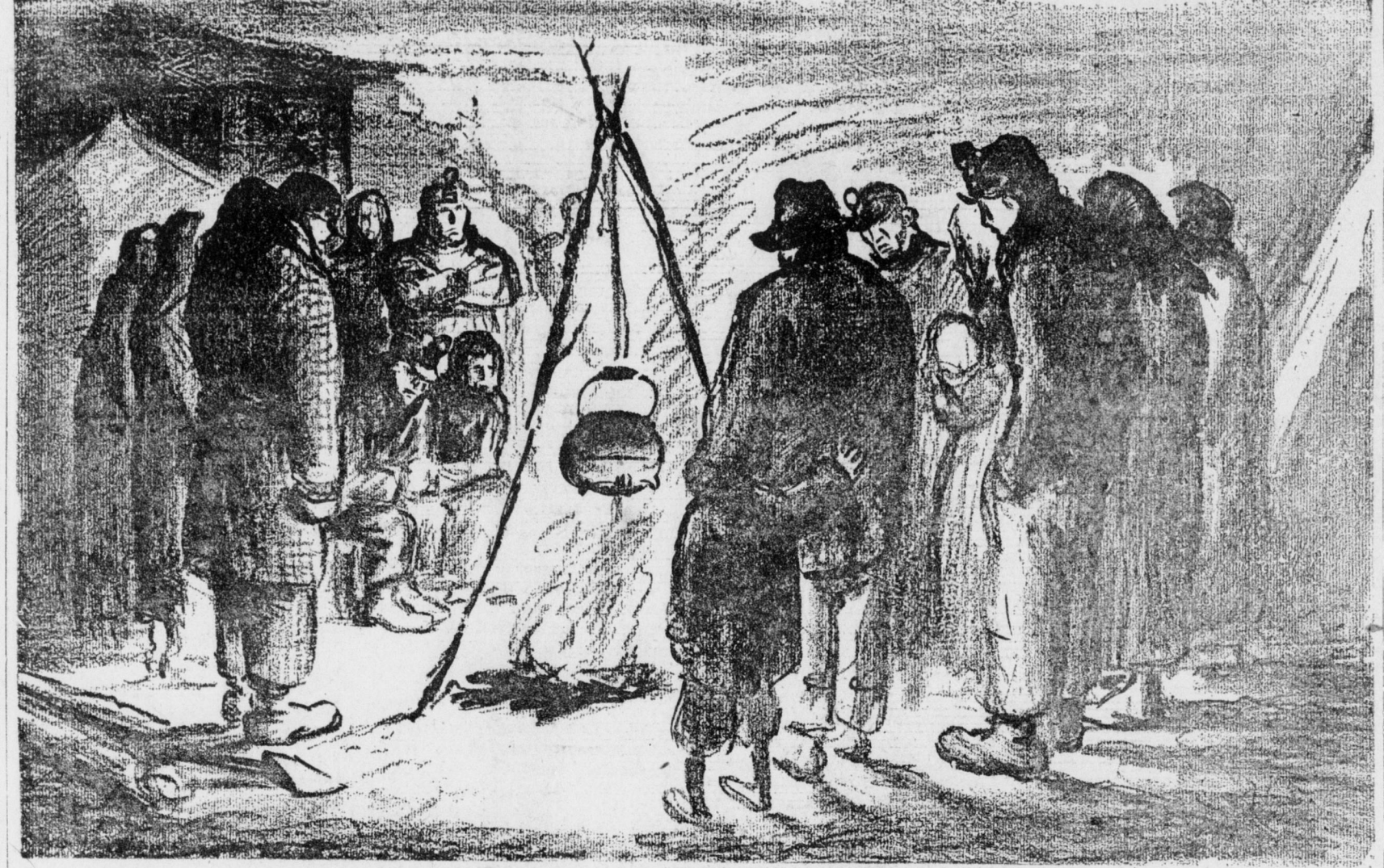
Thousands of striking miners and their dependends are in dire need and living in outdoor camps because of evictions from company "homes." They need money, food and clothing to keep them alive thru this struggle until they win.