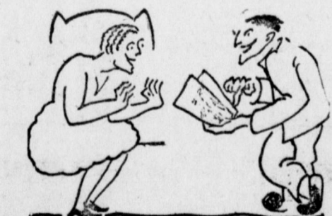
But, a ticket to the Ball-