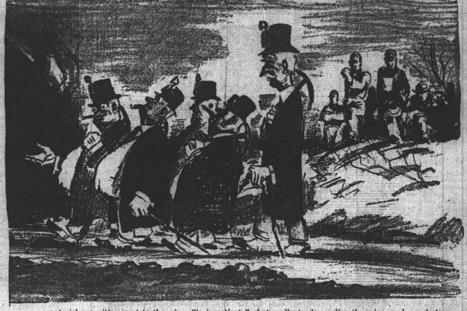
.... senatorial committee went to the mines "to investigate"—but really to demoralize the mine workers, destroy the miners' relief organization, and break the strike. But the silk-hatted strike-breakers will fail just as all other strikebreakers have failed to beat the heroic miners.