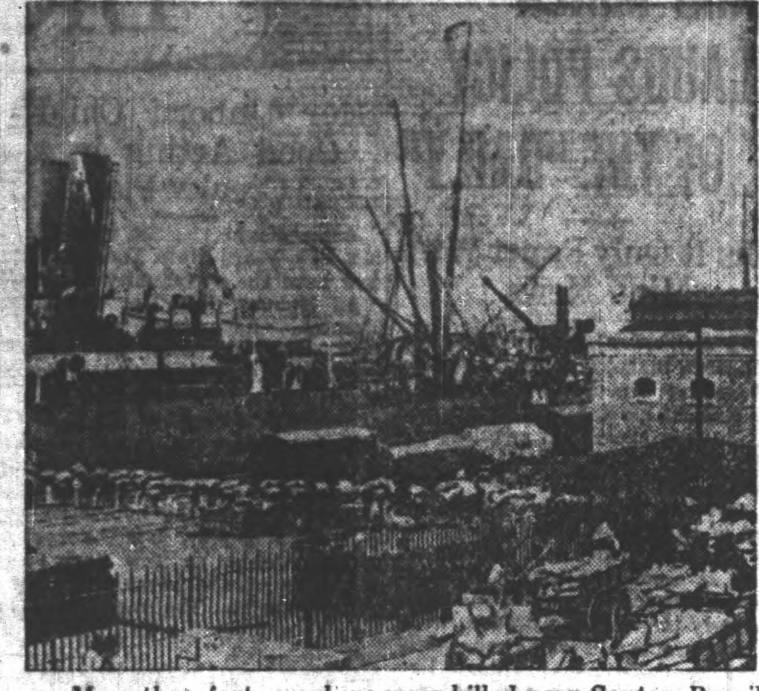
More than forty workers were killed near Santos. Brazil. during a land slide several days ago. Photo shows region where land slide took place.